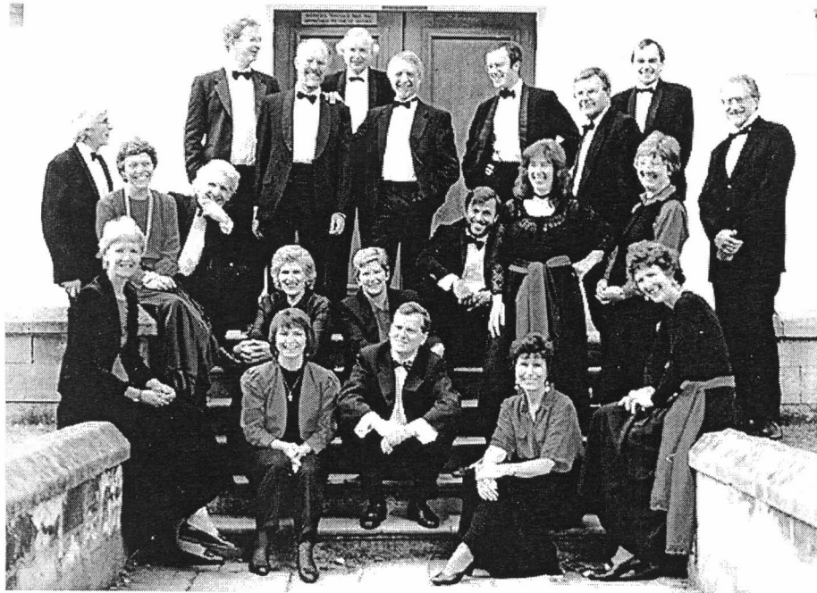
The Cherwell Singers (1986)

Regardless of changes in personnel, the Cherwell Singers remains one of the friendliest choirs around. The atmosphere owes a great deal to the sense of continuity provided by long-standing members who frequently put choir engagements above other commitments, and who work with each new conductor to ensure our continuing success and high standards of performance and vocal quality. The size of the choir ensures that every singer bears a significant part of the responsibility of the blended whole, with the result that the group is exceptionally sensitive to moods both of individual singers and the conductor. This is our biggest asset, though it can sometimes be a liability!