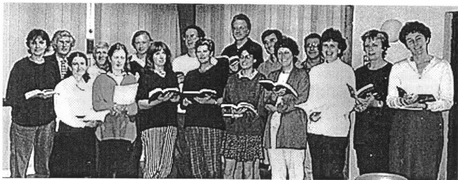
The Cherwell Singers (1998)

The busy schedule of the choir is a reflection of the energy and commitment of its members, and promises a long and healthy future.