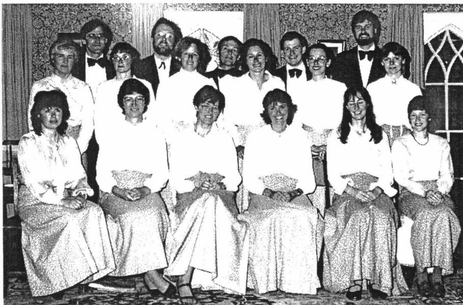
The Earliest known Pictorial Record of the Cherwell Singers (1984)